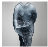
Nocturne 5 Karen LaMonte, 2017 Morrill Hall