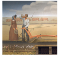
Breaking the Prairie Sod Grant Wood, 1936-1937 Parks Library