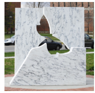
The Moth Mac Adams, 2008 West of Coover Hall